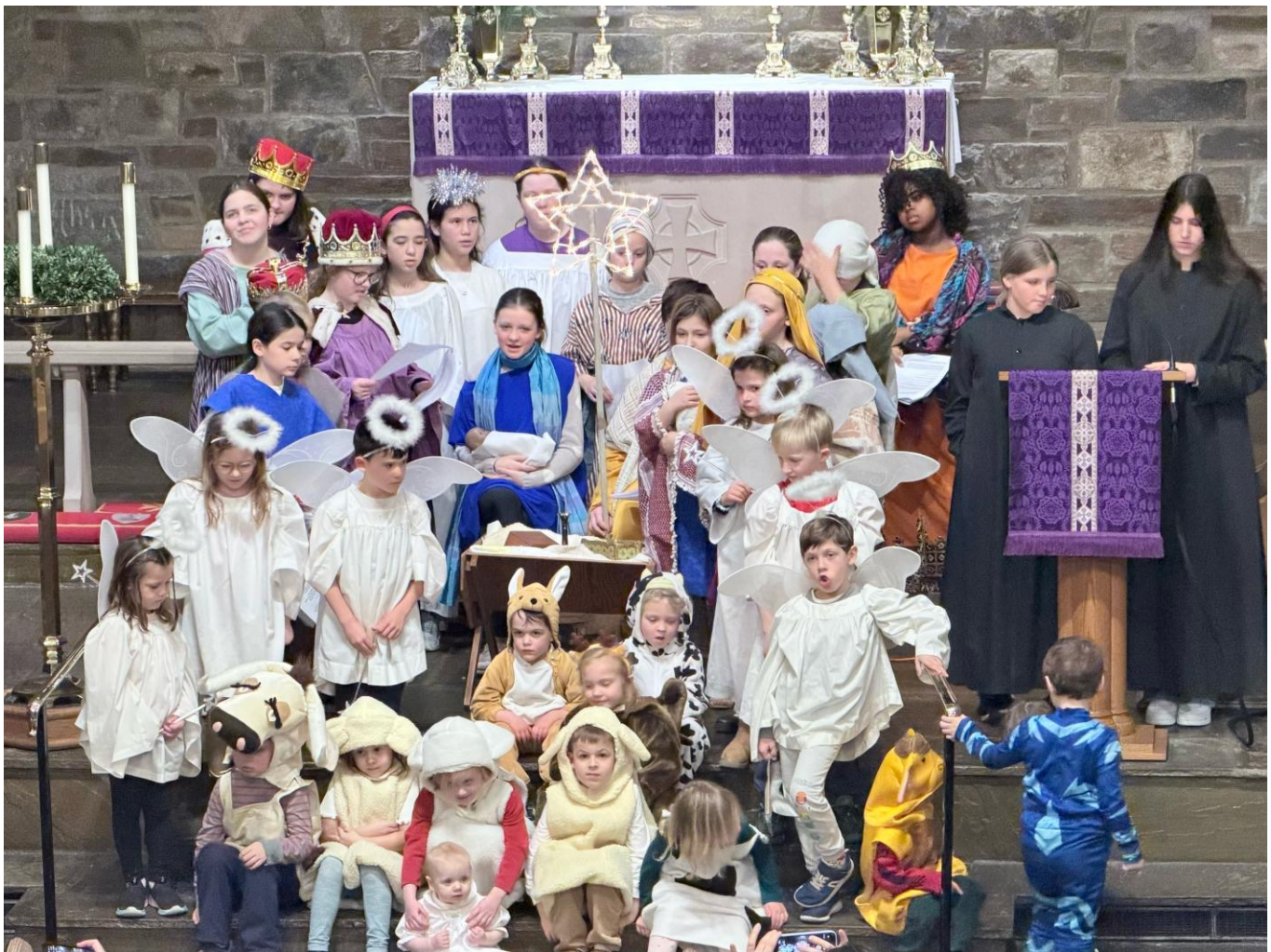
Above is a photo from last week's Christmas Pageant.

Fourth Sunday of Advent December 21, 2025– 10:30 am Choral Eucharist, Rite I