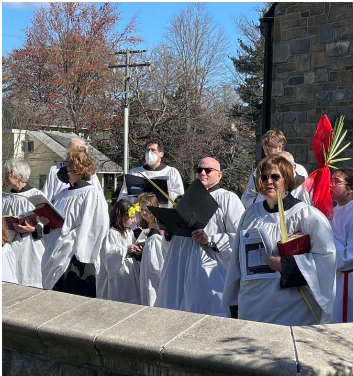
Palm Sunday 2023