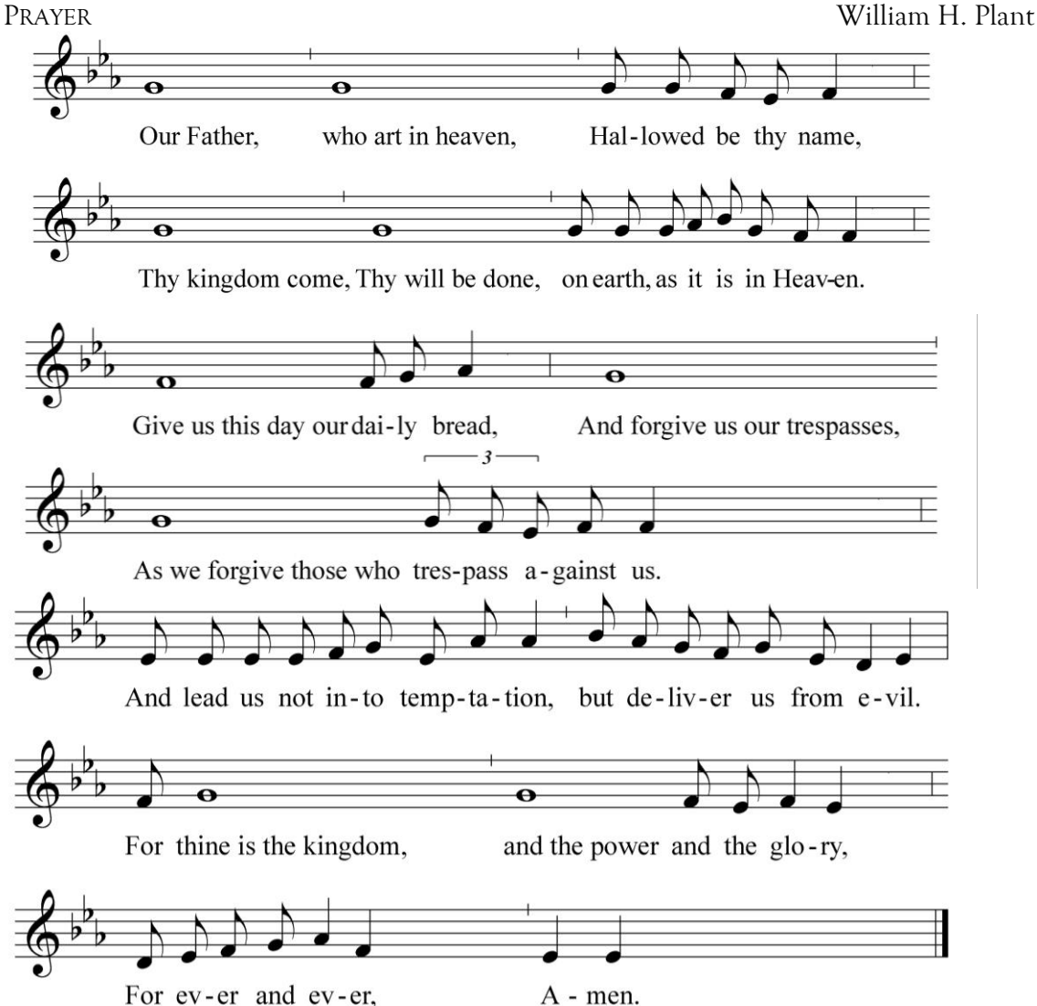
THE LORD'S PRAYER

And now, as our Savior Christ has taught us, we are bold to sing,