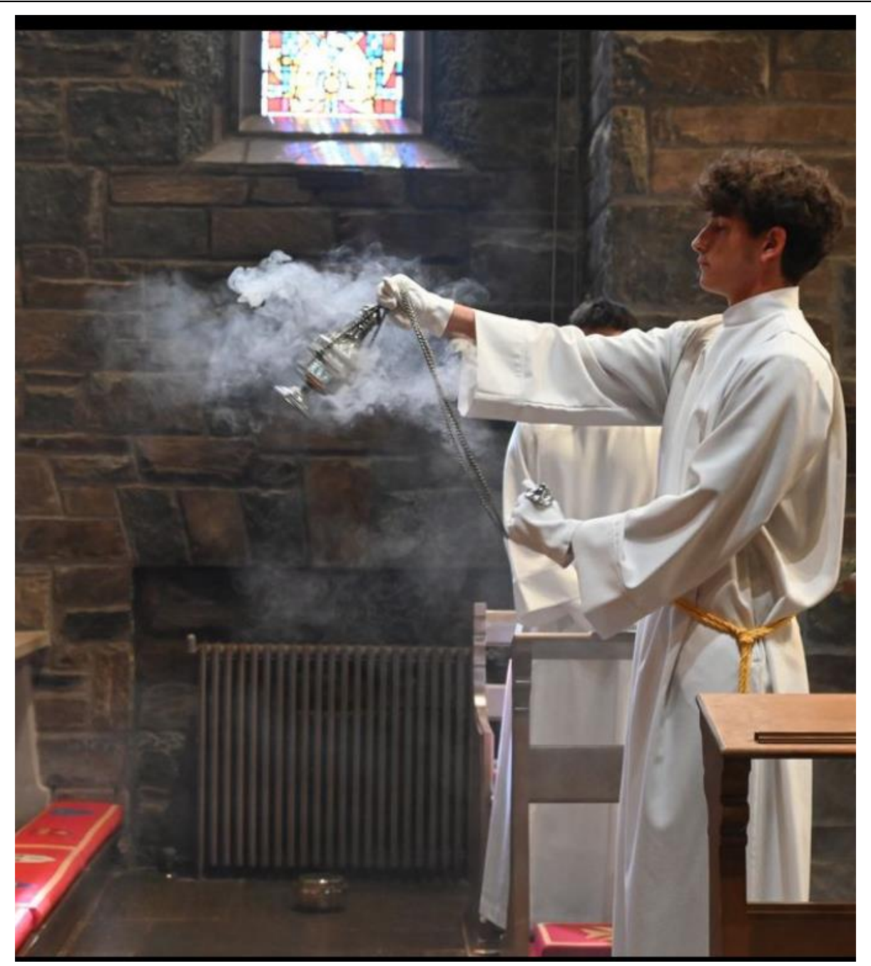
The season of Easter is a festival period in which the tone of joy is sustained for seven weeks; the use of incense is one way we mark this festive time.

Fourth Sunday of Easter April 21, 2024 – 10:30 am Festival Eucharist, Rite II