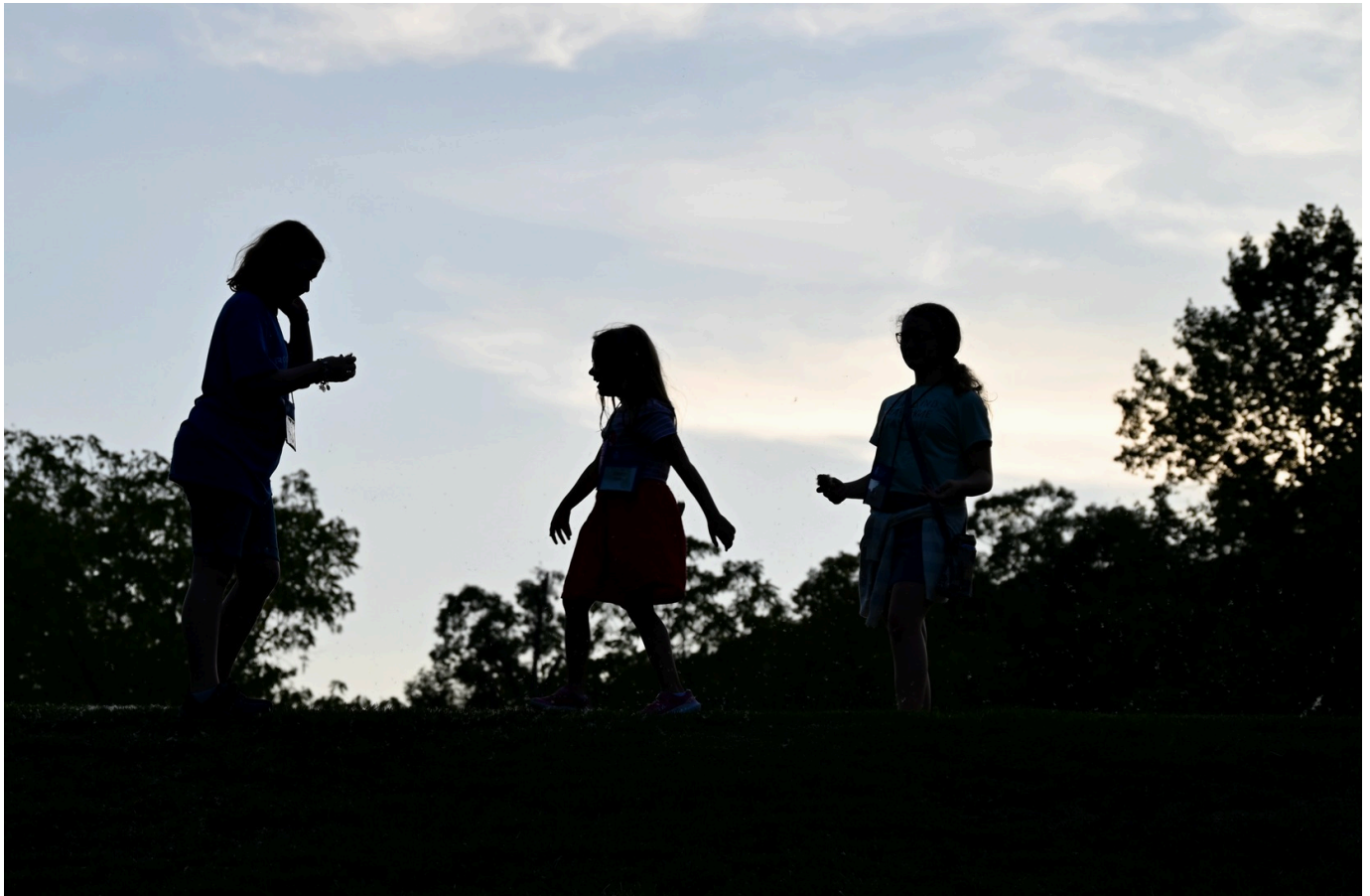
Children playing at the Shrine Mont Parish Retreat last weekend.

Seventeenth Sunday after Pentecost September 15, 2024 – 10:30 am Choral Eucharist, Rite II