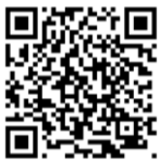
(Registration in English)