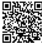
(Registro en español)